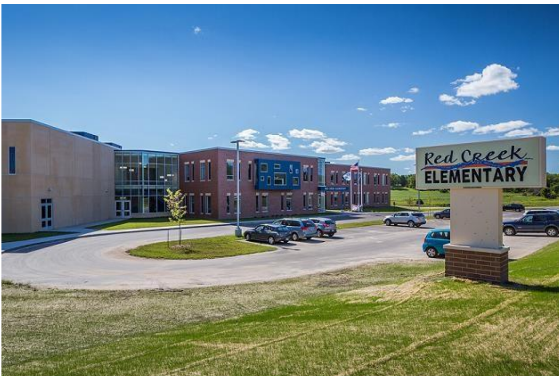
School District of Black River Falls – Red Creek Elementary